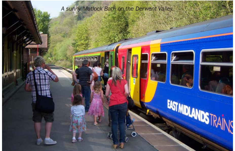
A sunny Matlock Bath on the Derwent Valley.

Over in Cumbria, the Oxenholme – Windermere route