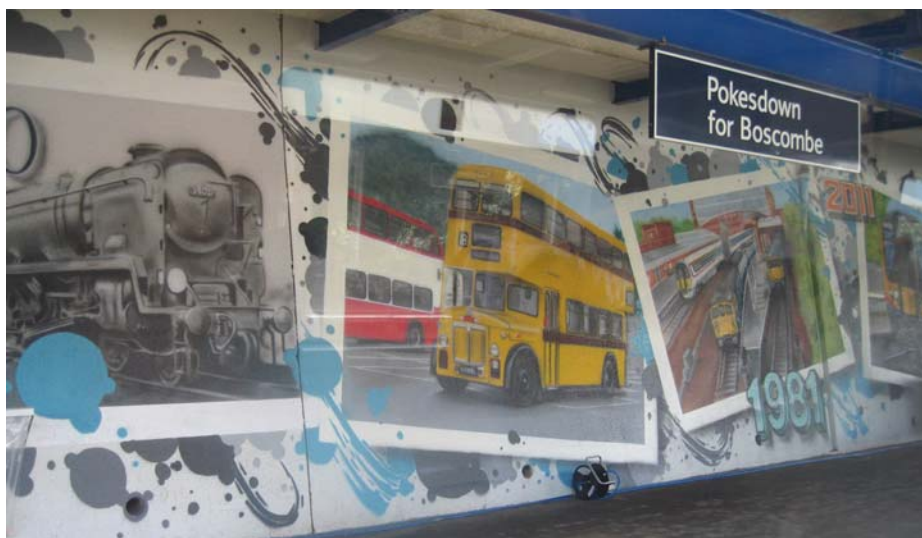
The award winning mural at Pokesdown Station.

On the South West Trains network, the station adoption team at Swaythling picked up first prize in the Best Station Adoption group category at the Community Rail Awards for a series of initiatives and schemes to make the station an integral part of the community.