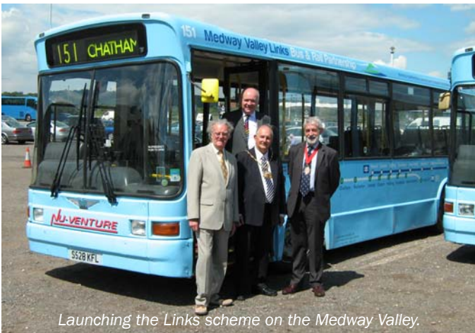
Launching the Links scheme on the Medway Valley.

Links between bus and train services in the Medway Valley have received a major boost with the launch of co-ordinated publicity, branded vehicles and rail ticket acceptance on the 151 bus route. A joint venture between Kent Community Rail Partnership, Kent County Council, Medway Council,