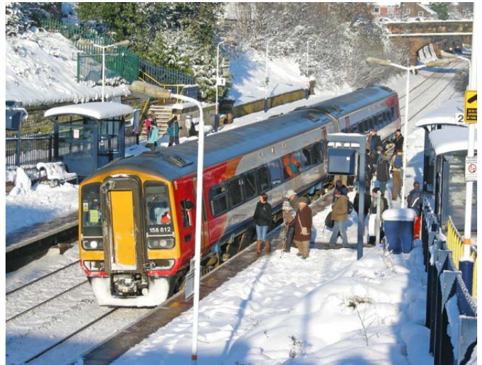
Commuters catch the train at Belper on the Derwent Valley during last years' winter snowfall. Few cancellations helped to restrict the impact to just 87% of trains on time.