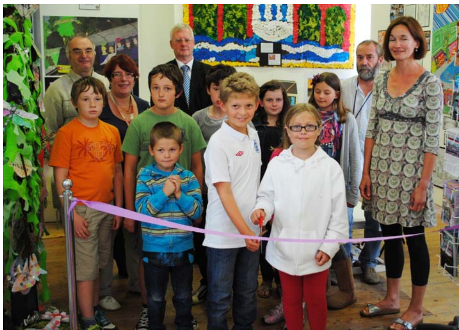
Children from Whalley Primary School open the exhibition

The exhibition, which ran for two weeks at the Platform Gallery in Clitheroe, also featured a display highlighting the work of children who visited the new Eco Station at Accrington, based around sustainability and using recycled materials.