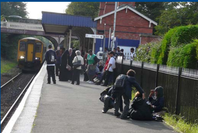
Students by train: Left - A school train calling at Redland Station on the Severn Beach line. Right - On the Medway line, students alighting at the unmanned Wateringbury Station.

And in its ongoing mission to fly the Community Rail flag, ACoRP will also be making presentations to the House of Commons and Welsh Government this autumn, aiming to further raise the profile of rural and community routes.