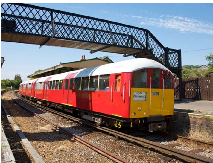
A Stagecoach service on the popular Isle of Wight Community Rail line