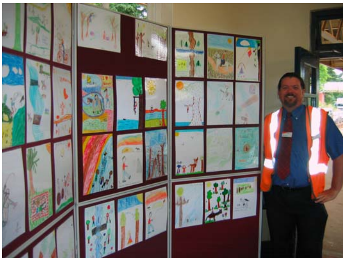
The community art exhibition at Brockenhurst

The Derwent Valley line has seen the introduction of an hourly service which runs through to Nottingham, with improved connections with main line services to London. In addition, a new morning peak service is set to launch in December 2011. As a result of the improvements made between East Midlands Trains and the CRP, this line has seen 86% growth over the last four years and is one of the fastest growing rural rail lines in the country.