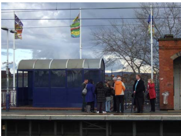
Flying the flag at Levenshulme.