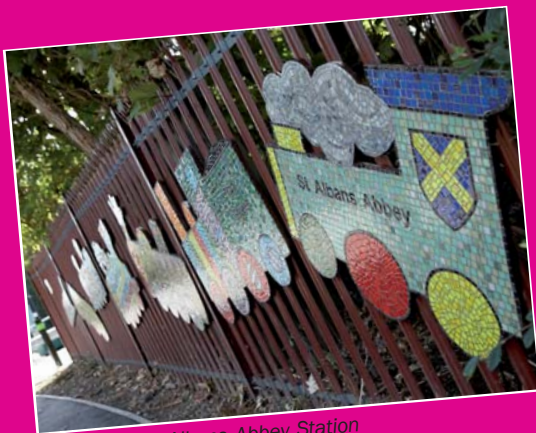
Mosaics at St Albans Abbey Station

The St Albans Abbey Station Improvement project has been shortlisted for the prestigious prize, which was due to be awarded at a special ceremony at the Palace Hotel, Manchester on 15 th July. (Editor's note - Unfortunately this was just after we went to print, so lets hope St Albans came out on top.)