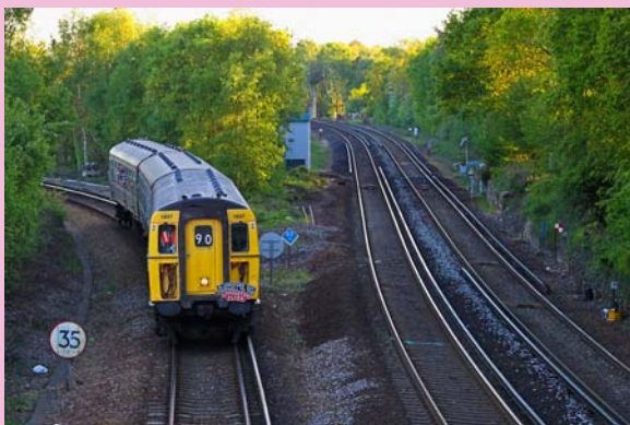
The Lymington Flyer makes its final journey from Lymington to Brockenhurst.

A variety of entertainment was also laid on, including live music, stalls and memorabilia.