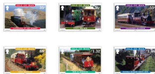
The Isle of Man's new stamps.

For further information visit www.gov.im/post/stamps .