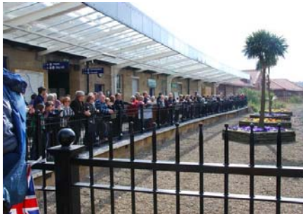
Helping the Heroes at Whitby.

Organised by the Esk Valley Railway Community Rail Partnership and supported by the local army cadets and Ryedale Folk Museum, the event served to highlight the importance of community spirit during the 1940s.