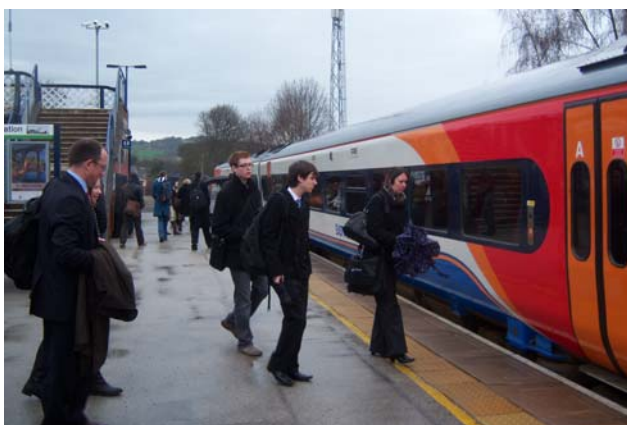
Passenger numbers are on the rise at Duffield.

The release of figures by the Derwent Valley Line CRP for 2009/10 show a 42% increase in passengers using local stations, with the biggest