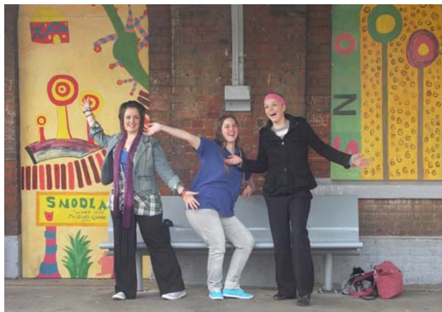
Celebrating the murals at Snodland

The artwork project materials were provided through a grant from ACoRP's Small Station Projects Fund, with the finished items installed by train operator Southeastern.