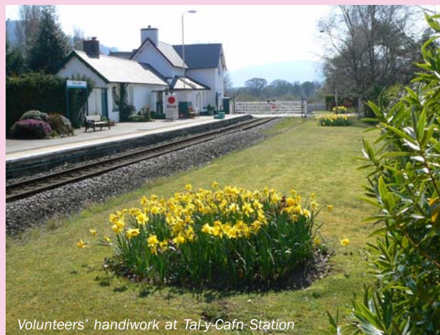
Volunteers' handiwork at Tal-y-Cafn Station

Dedicated volunteers from Tal-y-Cafn and Dolwyddelan on the Conwy Valley line saw their efforts rewarded at a special Stations Adopter's Conference held in Chester.