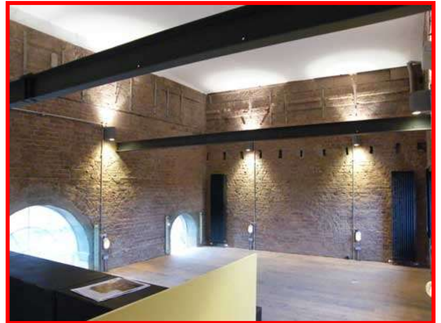
Edge Hill, Liverpool