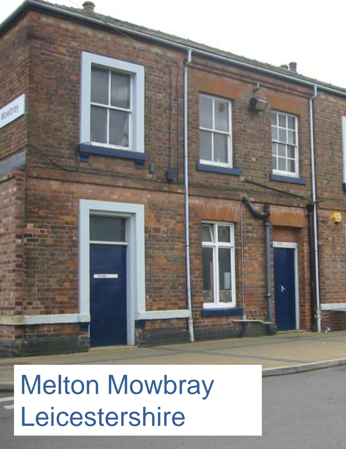
Melton Mowbray Leicestershire