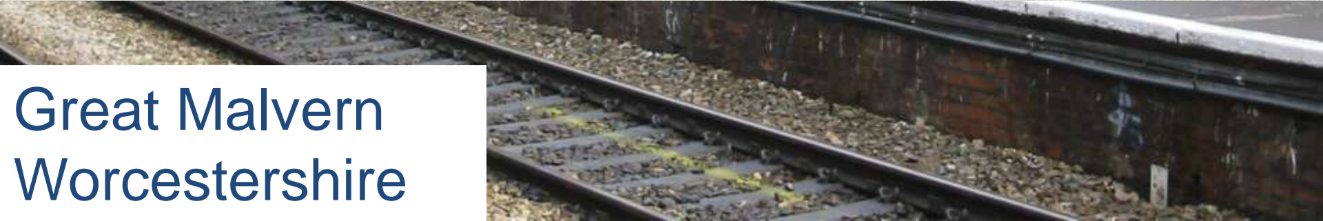
Great Malvern Worcestershire