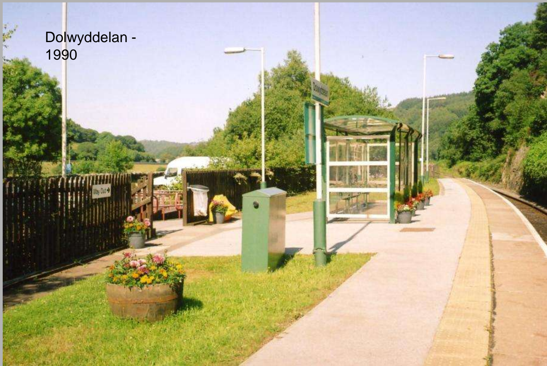
Dolwyddelan - 1990